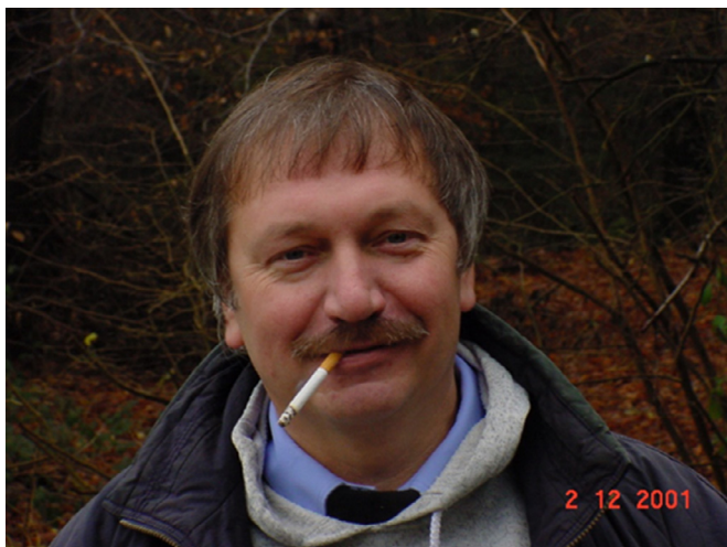
Fig. 1. NV at the age of 50. Note that smoking was not yet as restricted in Russia as last years.