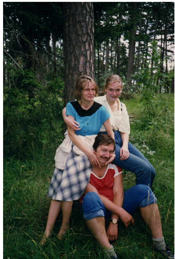
Fig. 3. NV with his wife and daughter in the 1990s.