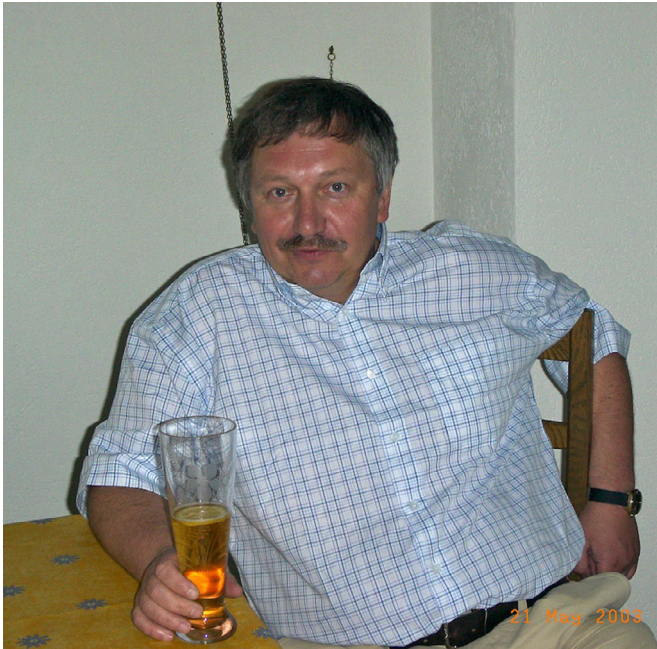
Fig. 4. NV on a rest in Germany in the 2000s.

memory and a frequency of about 10 KHz 4 . Moreover, this computer was available only during a couple of nights per week. Of course, this is hard to imagine now!